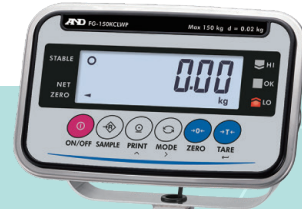
L-size platform (60 kg / 150 kg)