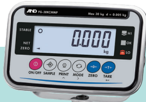
M-size platform (30 kg)